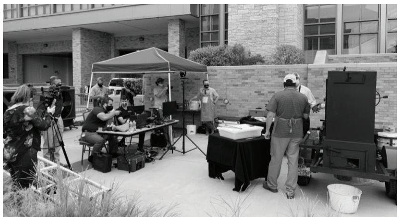
Cattle working at the 2022 Short Course and prime rib smoking demonstrations at the 2020 Virtual Short Course